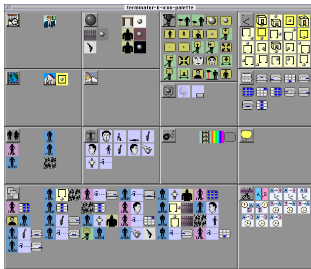
Figure 2: Icon Palette